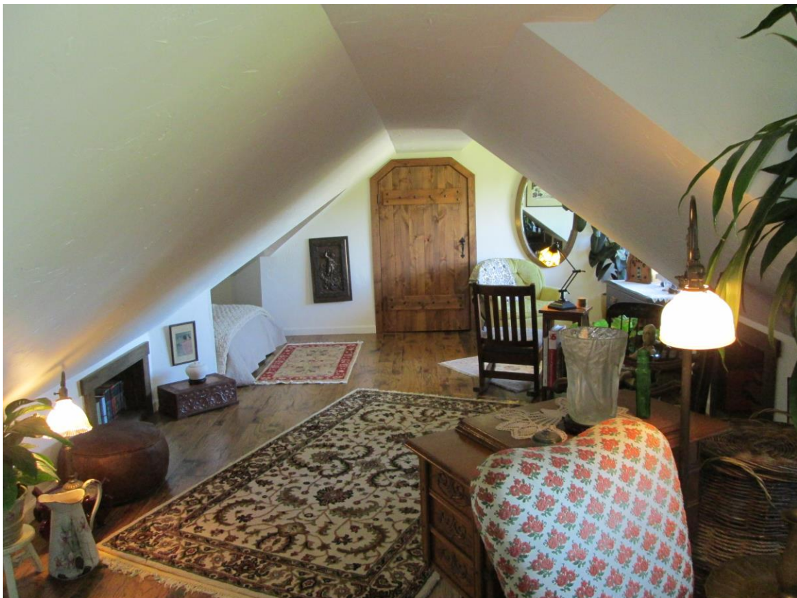
A charming converted attic, with intriguing nooks, niches and dormers in the Hetzler House