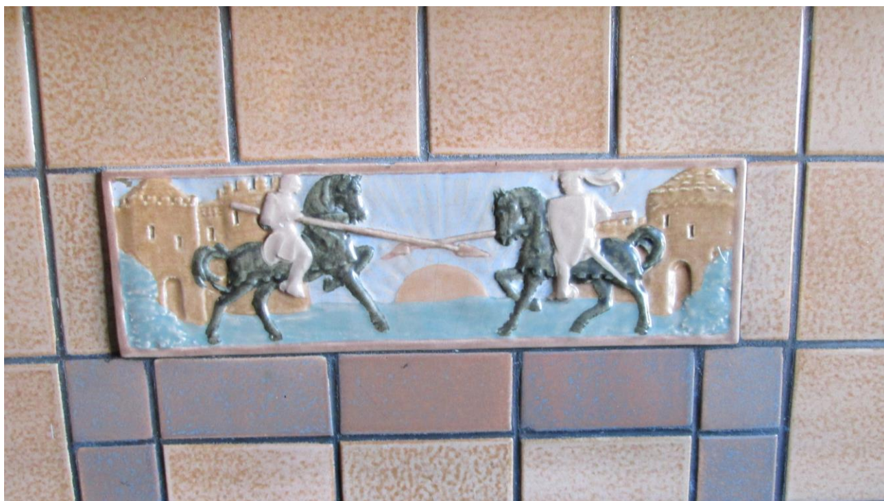
Jousting knights face off in this tile on the arts & crafts fireplace in the mayor's house.