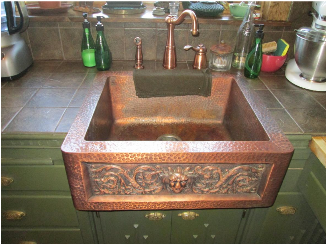
A wonderful hammered copper sink in the kitchen of the Hetzler House