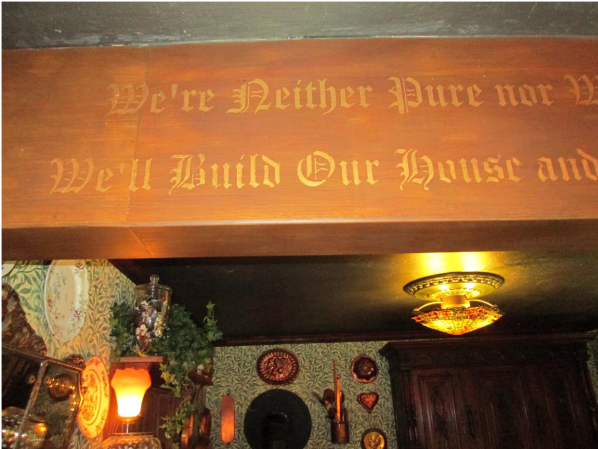
Lines from the libretto of the operetta Candide, stenciled on a beam of the Hetzler House.