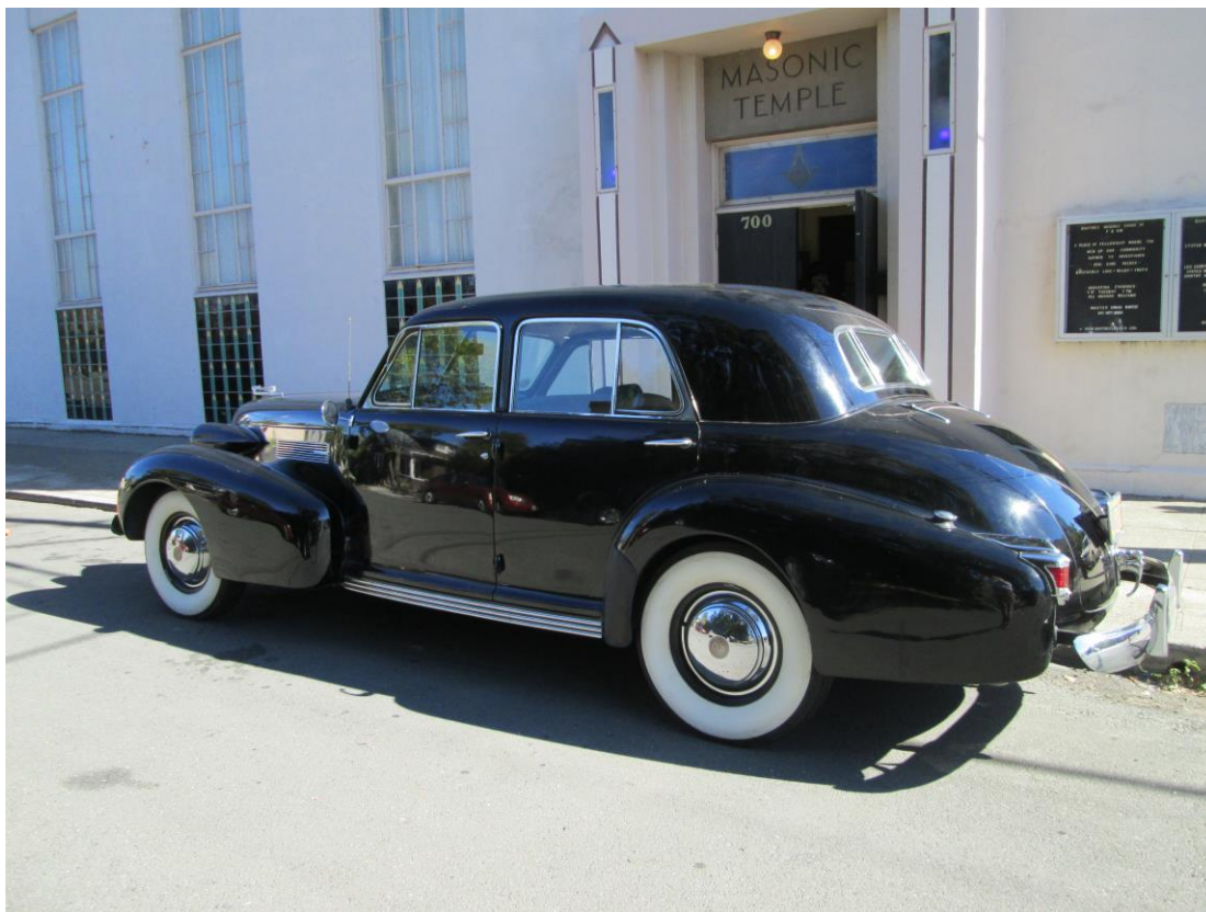
Vintage cars are a part of the Home Tour. The 1930 Masonic Temple was only nine years old when this 1939 Cadillac Fleetwood 60 Special rolled off the assembly line.