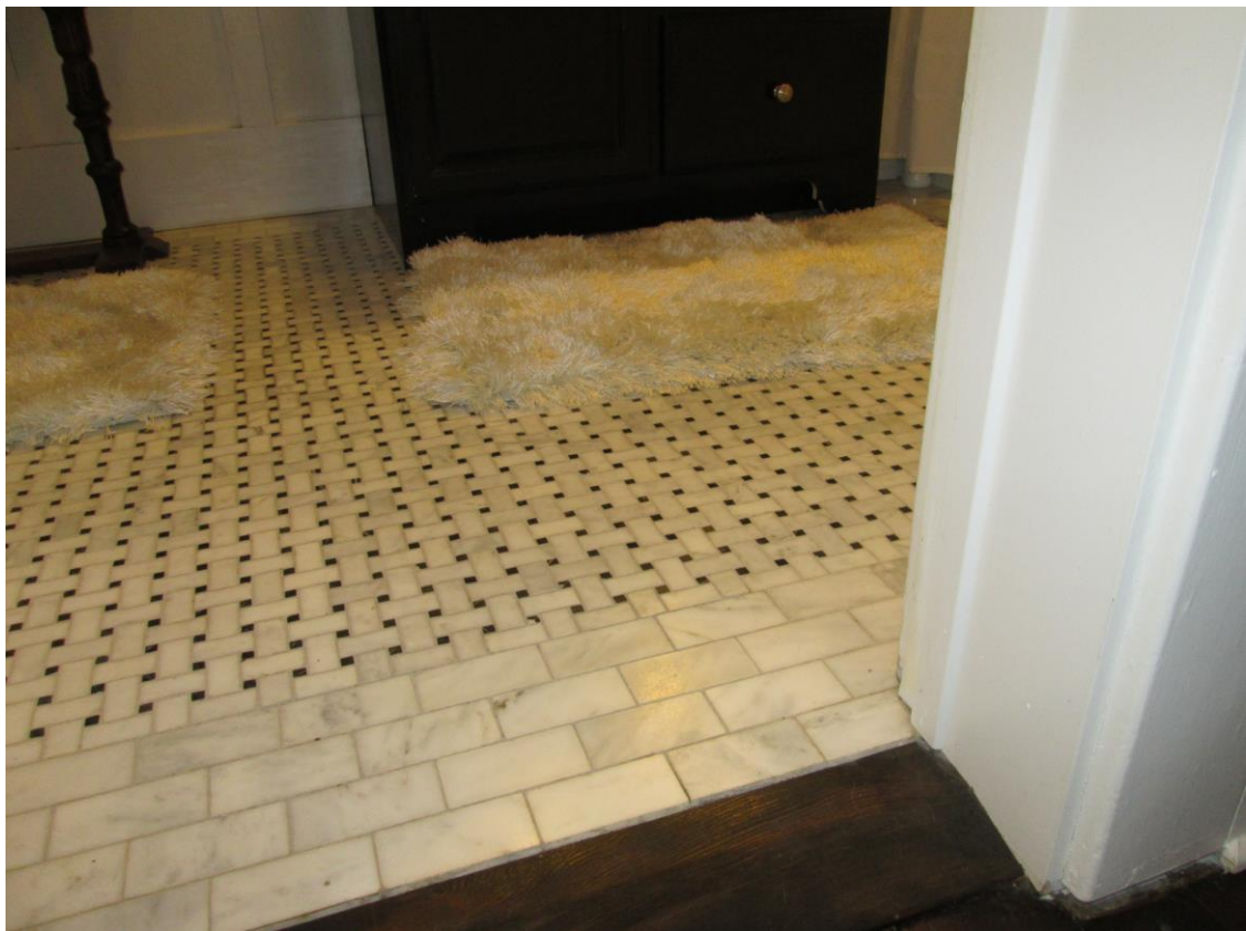
A new bathroom in the 1922 Christiansen residence uses traditional black and white marble tile to emulate the flooring in a bathroom from the era in which the house was built.